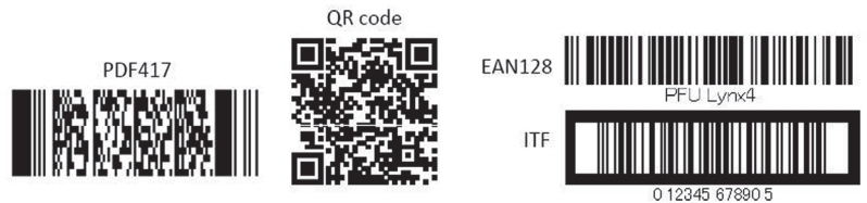
Premium supports Two Dimensional Barcode Recognition, PD417 and QR Code. Standard adds EAN128 and ITF barcodes.